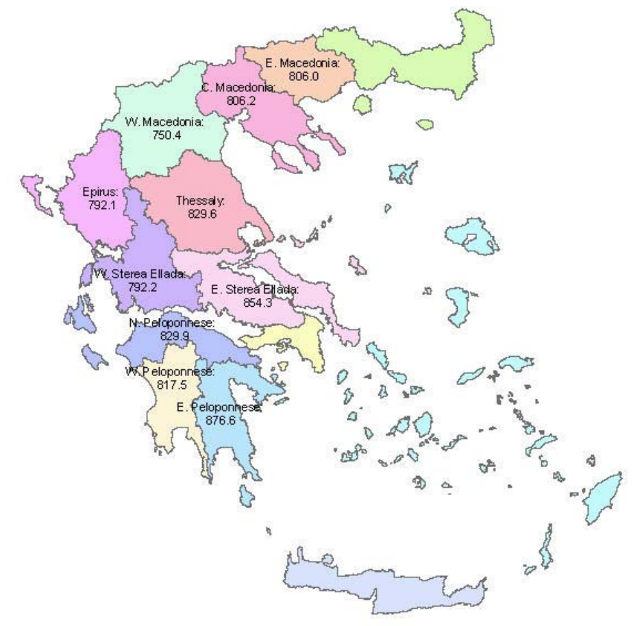
Figure 2: Results of potential evapotranspiration estimated from the Thornthwaite method

For the water district of western Macedonia, the Hargreaves method in conjunction with the Thiessen method for spatial integration produced an estimate of 1066.7mm for mean interannual areal potential evapotranspiration.