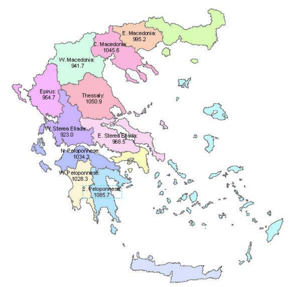
Figure 3: Results of potential evapotranspiration estimated from the Blaney-Criddle method